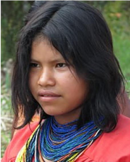
Send us a photo of this people group