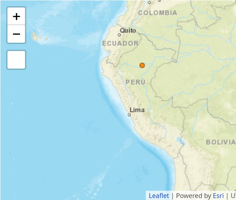
Send us a map of this people group